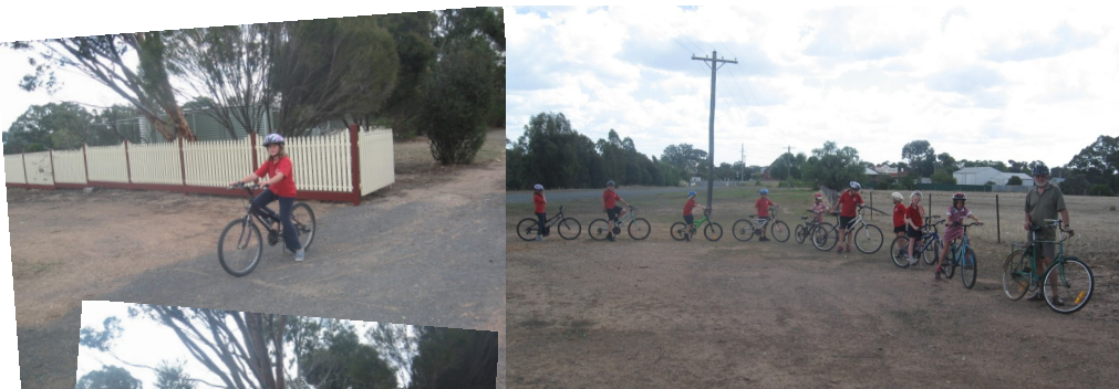
Bike Ed in action