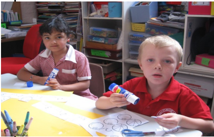
Our 2013 Preps